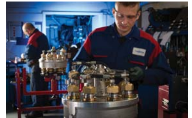
Parts & Servicing